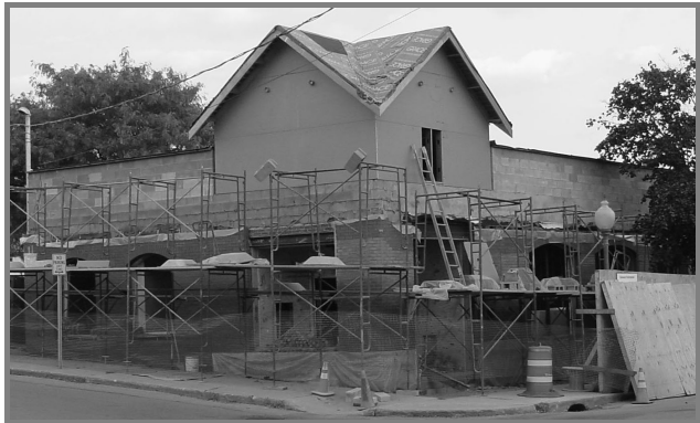
The final results of the remodeling can be seen below. The credit union building is located in Saratoga Springs, New York.