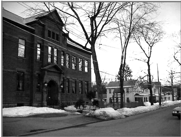
A former public school has been rehabilitated for use as a private school in the City of Saratoga Springs.

ordinance prohibited educational uses from locating in its “Single Family Historic District,” which encompassed the “General Electric Realty Plot,” a distinctive nine-block area of 120 homes developed at the turn of the 20th Century and listed on the National Register of Historic Places. The Court held that because of the competing public policy interests in education, such uses should not be foreclosed from locating in a residential zoning district, even a historic one. The Court further held that there must be a case-by-case deliberative process in which “proposed educational uses must be weighed against the interest in historical