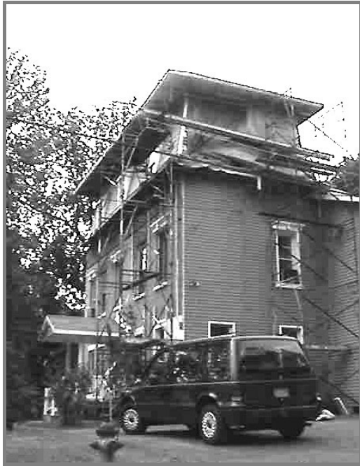
Among the items which can be reviewed by a local board is the materials used in the alteration of an historic property.

Standards for alterations and rehabilitation of historic structures are often borrowed from the United States Secretary of the Interior's Standards for Rehabilitation of Historic Properties. 22 Other sources of information on standards for use by municipalities are the Preservation League of New York State, county and regional planning agencies,