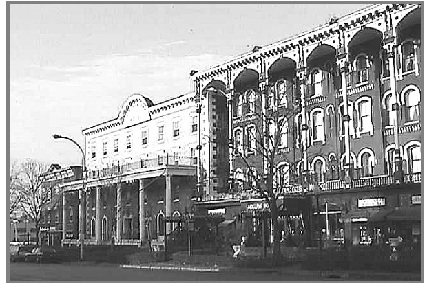
A view of Broadway in Saratoga Springs, New York.

districts, separate historic preservation laws authorized by General Municipal Law § 96-a and Article 5-K are typically used to protect individual