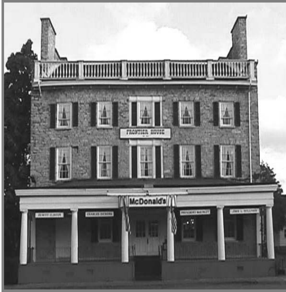
The owner of this building in the Town of Lewiston converted it into a fast food restaurant.

Listing of a property or area on the National and State Registers by itself does not limit the private uses of the property. Owners of property eligible to be listed are sometimes opposed to listing, because they think it automatically regulates what