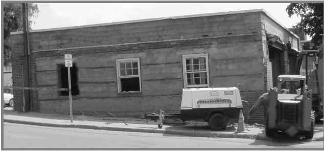
This one-story building in an historic business district is being remodeled to better match the scale and appearance of older structures.

proposed projects in historic areas and require applicants to meet certain architectural requirements. Where an historic zoning district has not been established, a local site plan review law could require that any alterations to designated historic structures undergo site plan review. The standards for review should be established in the site plan review law or ordinance.